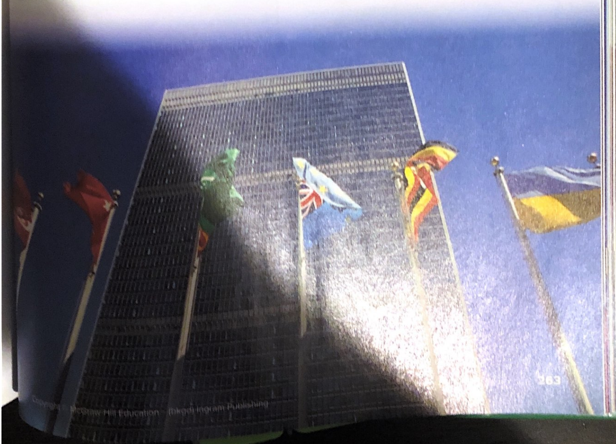
The flags of every member nation fly in front of UN headquarters in New York City. ©

What was one effect of the growth of suburbs in the 1950s? Cause and Effect